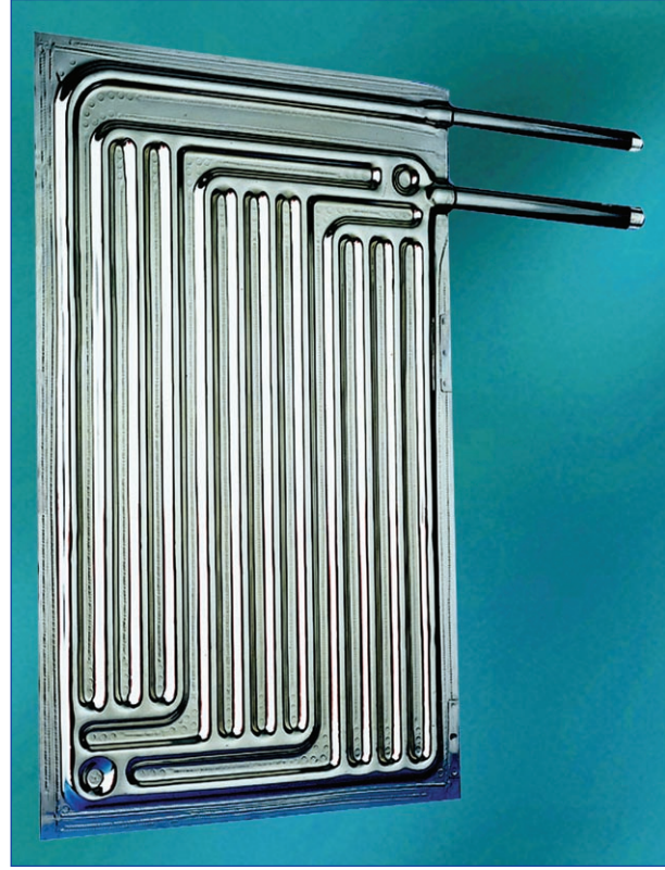
Figure 3. Tranter plate coil all welded heat exchanger suitable for bunker oil heating.

be specified directly, but experience has shown that it is very hard to predict them in an accurate way.